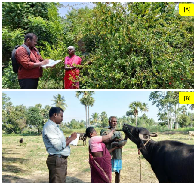
Fig. 1: (A) Documentation of ethnoveterinary medicinal plants and (B) mode of application of ethnoveterinary medicine in rural areas of Salem district, Tamil Nadu, India.

Salem district is situated between 11° 14' and 12° 53' in North latitude between 77 ° 44' and 78° 50' in East longitude and bounded on North by Dharmapuri district, South by Tiruchi and Namakkal districts, East by Kallakurichi district and West by Erode district and Karnataka state. The household medicinal plants survey was conducted in Salem district. Salem is one of the biggest districts and it is centrally situated in Tamil Nadu. A total of 250 homes and 200 ethnic group of people residing in rural areas of taluks such as Omalur, Mettur, Nangavalli, Mecheri, Jalakandapuram, Kadayampatti, and Taramangalam and adjacent areas were surveyed. The occupation of the people were observed as farmers, teachers, drivers, homemakers, weavers, shop keepers, merchants, traditional healers and herbal practitioners (Alagesaboopathi, 2015; Ayyanar, 2013; Dhole et al. , 2021). Further, the plant parts used, type of diseases treated, number genera and species along with family of the ethnoveterinary medicinal plants have been documented using standard questionnaire format. The plants and their ethnoveterinary utility were scientifically documented along with photographs (Fig. 1). The percentage plant parts utilized, mode of preparation of ethnoveterinary medicine and application were also documented per plant/disease treated.