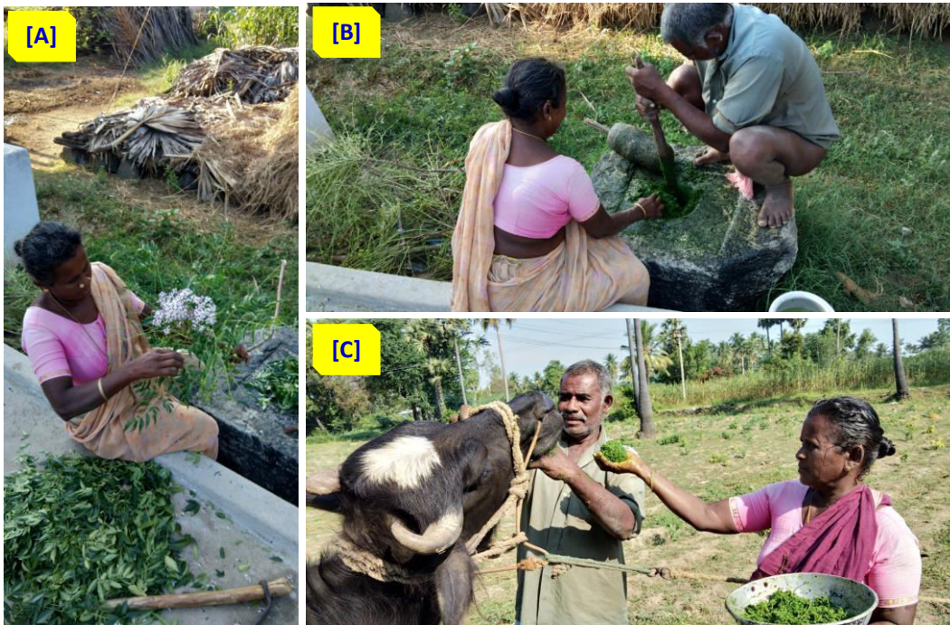
Fig.2 Preparation and administration of ethnoveterinary medicine from Melia azedarach .